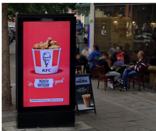
Stand-alone 'bus stop size' digital screens (called 'six sheet' size). Most of these are on private land, but some will be owned by local authorities

There are different types of outdoor advertising billboards. These consist of large digital advertising screens, older paper poster sites and bus stop advertising panels (digital and paper). It is common that local authorities have direct control over bus stop advertising spaces (bottom right) as well as smaller sites such as lamppost ribbons. However, some local authorities own a small number of larger advertising sites as well. If a council creates an advertising policy to restrict advertising for certain products, it can be applied to advertising sites it owns – but not to ad sites on private land.