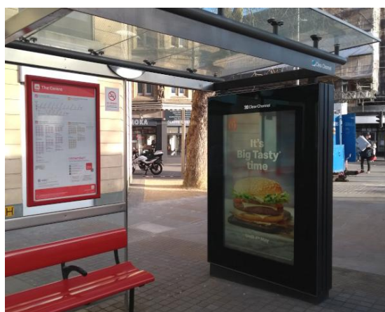
Digital screens and paper 'six sheets' at bus stops. These could be controlled by an 'Advertising Policy' created by a local authority.